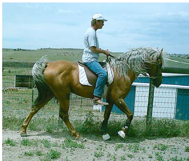
Remember Prayer Warrior with his trainer

Warrior is a 15.3 hand, striking palomino with a beautiful long silvery mane and tail. He has tremendous bone and feel as befitting an "old-time" Walking Horse. He has a wonderful natural flatwalk, running walk, and a SUPERB rocking-chair canter and he can do it ALL barefoot. His foals inherit those natural gaits and his beautiful head, proving that the Heritage breeding carries forward. It's truly wonderful to look out in the field and see the ghosts of the past come to life!