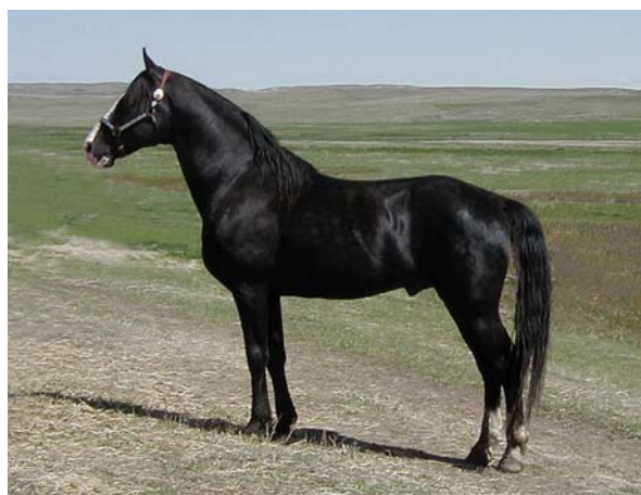
Slush Creeks Jubal S