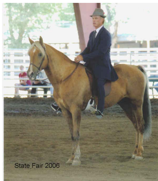
Warrior at the Colorado State Fair, 2006