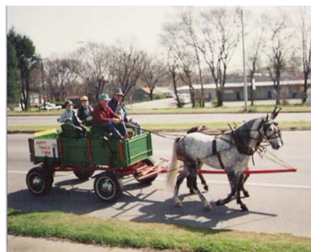
Bullet & one of Leon's Jacks in the Mule Day Parade, Columbia, Tennessee