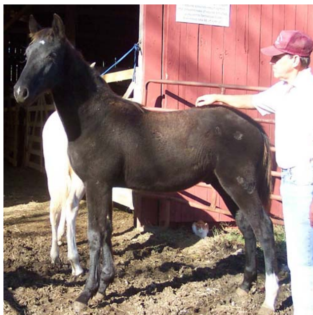
Sun's Smokin' Midnight, one of Smokey's colts, now stands at stud in South Carolina