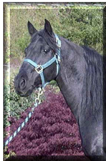
"Larry" at age 19