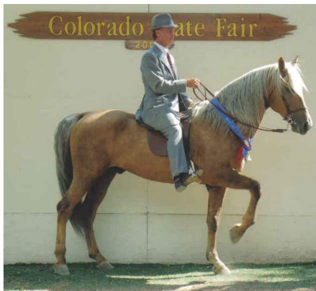
Colorado State Fair August 2006