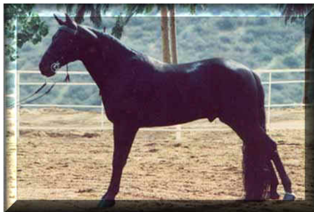
Go Boy's Windwalker

Go Boy's Windwalker carries the bloodlines, disposition, gait, tractability, soundness, and mind the Tennessee Walking Horse has been bred for. He carries no Midnight Sun and traces back to such great horses as Merry Boy, Brown Allen, Society Man, and crosses wonderfully to all Midnight Sun bred mares. He squares up the pacier and adds bone to the more refined modern Walking Horse.