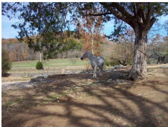
Bullet relaxing under his favorite shade tree

Owner/breeder Leon Oliver is always proud to show off his stallion. Bullet stands at Brown Shop Road Farms where the welcome mat is always out for those who want to talk TWH history and discuss good horses.