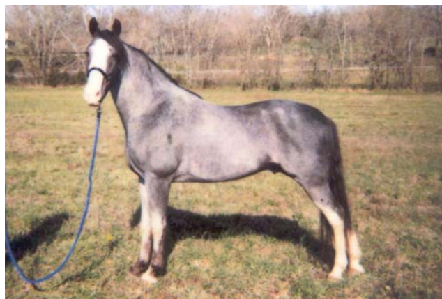
Sun's Smokey Midnight