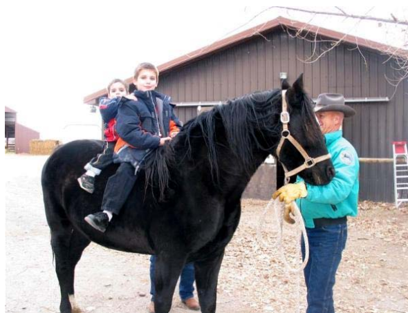
Bonfire entertaining the kids